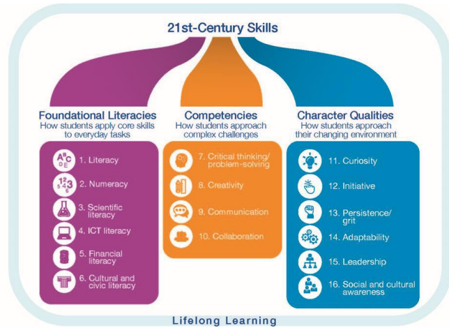
Figure 2. The 21<sup>st</sup> Century Skills (WEF, 2015)

Similarly, WEF (2015) as cited by Dadios et al (2018), there are lists of 21st century skills that groups into: (1) foundational literacies, (2) competencies, and (3) character qualities as shown in Figure 2. It is recognized that foundational literacies are the basis on which students will build the competencies and character qualities. These competencies are needed to face complex challenges while the character qualities are what students need to navigate changing environments. The authors also emphasize that aside from generating competencies and skills, the quality assurance and certification systems should facilitate movement across formal, non-formal and informal education systems. The assessment and certification of knowledge learned outside the classroom are importance sources of building qualifications. Brown-Martin (2017) as cited by Dadios et al (2017), a key skill to be developed among learners is "learning how to learn" where the graduates embrace lifelong learning, continuous training and retraining.