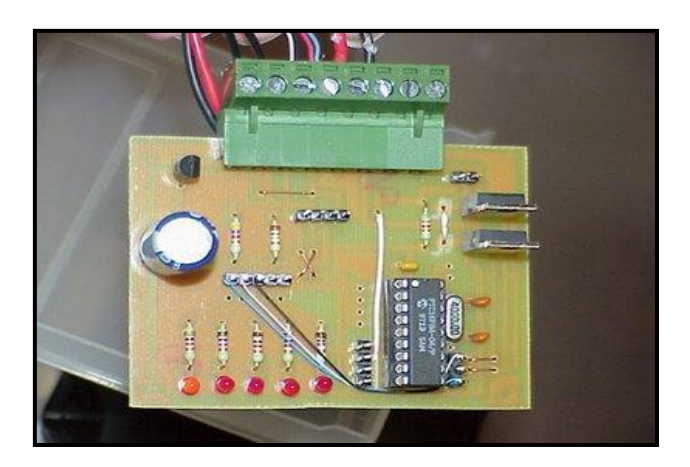
Fig -1: Name of the figure

content here.Paragraph comes content here. Paragraph comes content here.Paragraph comes content here.Paragraph comes content here.