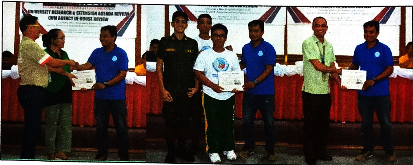
Fig. 22. Winning entries for the poster category.