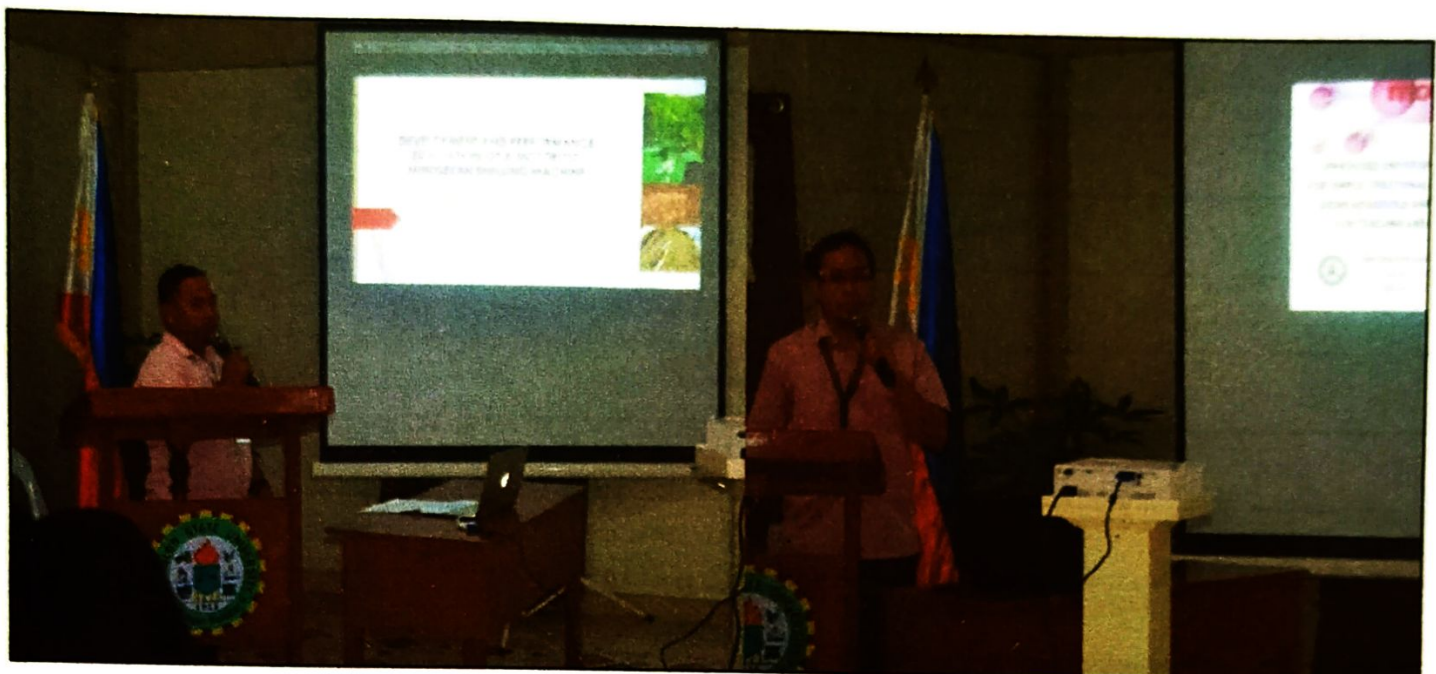
Fig. 11. Some of the paper presenters in the Development category.

Facilitators: CBA & ICJE RET Coordinators