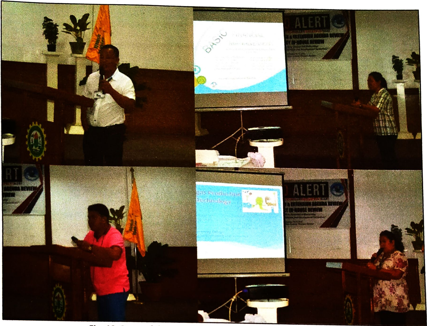
Fig. 10. Some of the paper presenters in the Extension category.

Facilitators: CED & Calatrava RET Coordinators Venue: AVR