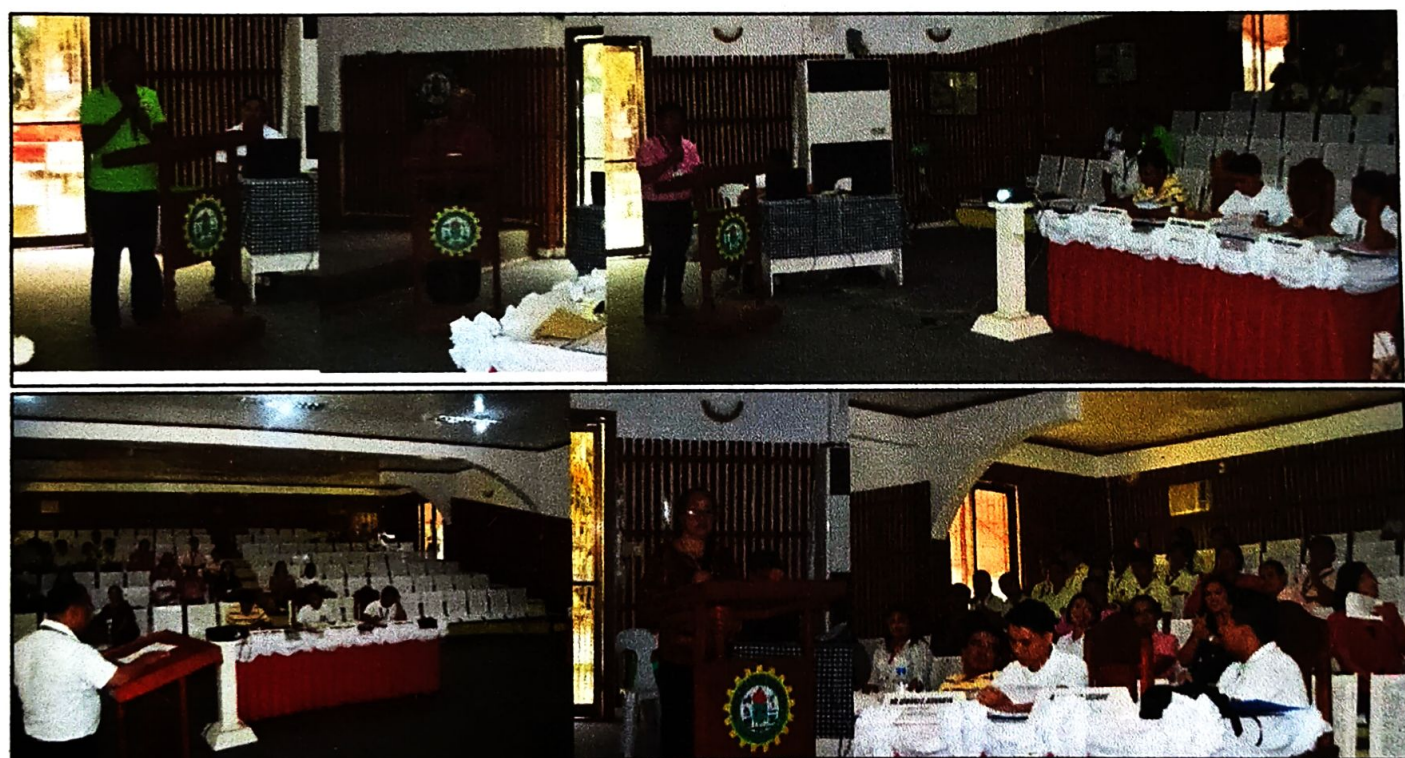
Fig. 9. Some of the paper presenters in the AFFNR category.